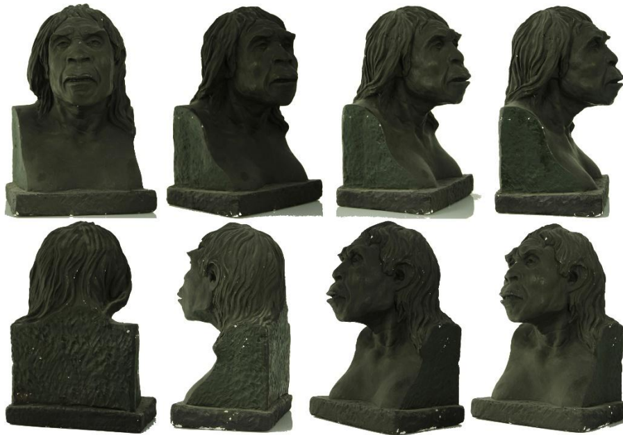
Fig. 2. A set of previously shot scenes that will be used as separate exposure frames of digital space