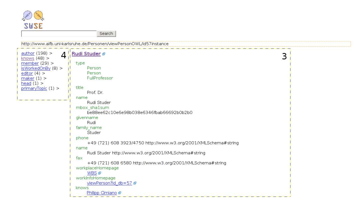
Fig. 2. Entity page containing information about Rudi aggregated from multiple sources.

incoming relations to the focus instance in a column on the left side of the pane (4). Users are shown that Rudi has authored 198 papers, that 48 people know him, that he is the maker of a file and editor of four things.