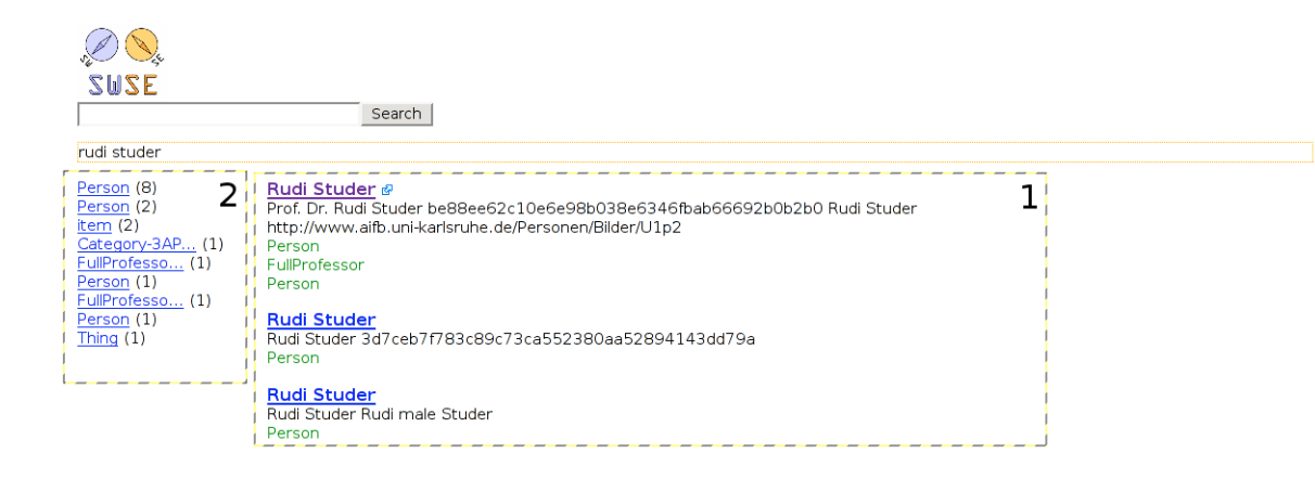
Fig. 1. Results list page after typing in keyword.

and describing not only his personal information (contacts, interests, work environment) but also his surrounding entities (people he knows, his projects, his organisation). Please note that the interface, although demonstrated on browsing a social network, is domain independent and can similarly be used to navigate information spaces in other domains as well.