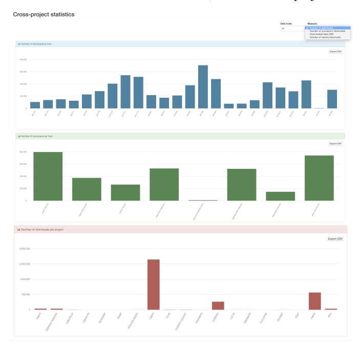
Figure 2. Cross-project view. This view spans across all the registered projects and provides information of key data download metrics over three different dimensions: time, data node and project.

This view provides information about the data downloads (number of downloads, size, number of successful downloads) over three different dimensions: time, data node and project.