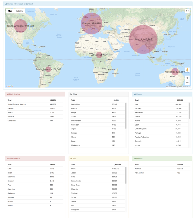
Figure 4. Downloads spatial distribution. This view provides georeferenced information on data downloads from a client-side perspective. Metrics are gathered by continent and by country.

This view is particularly interesting because it gives a georeferenced client-side perspective of the data usage. Of course, sensitive information is not provided being filtered out at the level of each single data node (leaves). Moreover, the country level of details can reveal how much a specific country is actually involved using/exploiting the CMIP data and in