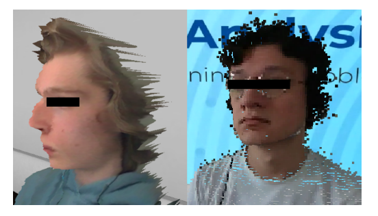
Fig. 3. Left: indexed mesh model, right: point cloud model

less visually complete (see figure 3). Users have the option to alter the appearance of the 3D model, for both methods of rendering, as seen by them in real time. This includes: toggling the visibility of the 3D model, changing between the two model types, changing the resolution of the 3D model and changing the position of the 3D model within the classroom.