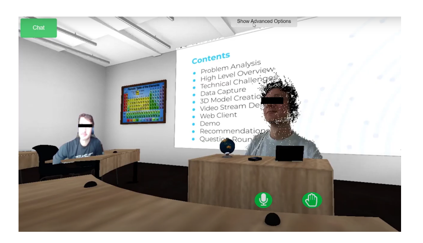
Fig. 5. Student's view of the holographic teacher during lecture.

Students are able to see and hear one another within the virtual classroom environment facilitated by their browser. The placement of students is such that it mimics the rows of seating in a physical classroom. A chat facility is also available as an alternative to interacting with audio. Students are provided with the typical options of an online meeting platform, such as disabling their video or microphone. Most importantly, the students can view and listen to their teacher as a hologram within the virtual environment (see Figure 5). This allows more naturalistic interactions and communication between teachers and students.