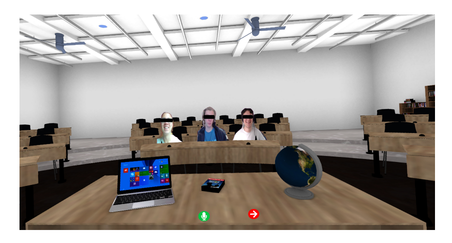
Fig. 1. Teacher's view of the classroom.

The services provided by the "HoloLearn" prototype must be be accessible to all students and support lectures with large number of students. Therefore, the project uses a browser based 3D classroom environment to allow students with varying computer resources to access lectures (see figure 1). However, it should be noted that the holographic lecture can be hosted in other ways such as within a virtual reality environment. However, due to virtual reality glasses currently not readily available for all the students, we decided to first implement the browser based platform. The browser based classroom environment facilitates student to student interaction, displaying of the teacher's 3D model and sharing of on screen content along with audio channels. The goal in constructing the prototype classroom was to identify and assess different technologies that are capable of supporting such an experience.