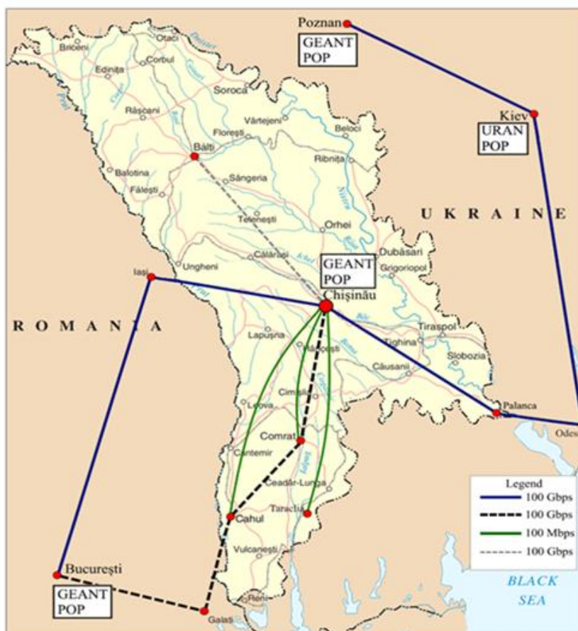
Figure 1. Topology of proposed CBF connections

The general scheme of regional connectivity proposed for implementation, that is taking into account the requirements of RENAM and URAN, is shown in [fig. 1]. The proposed solution based on results of previous studies and analysis of new RENAM and URAN connectivity requirements, overview of the currently available options to use DF, lambda or spectrum resources.