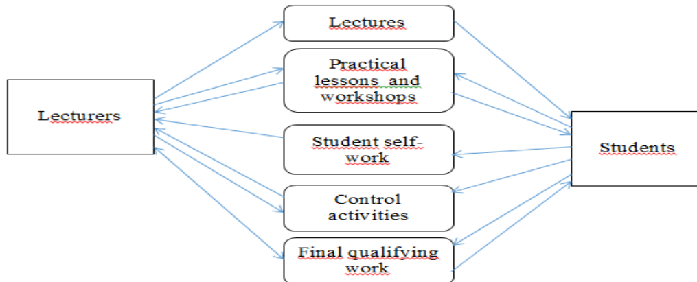
Figure 2: Information flows between objects and subjects in distance learning

of educational activities as lectures, seminars (practical classes), laboratory and practical work, term papers and projects, tests and exams, final qualification works (FQW). The subjects of constant contact are students, academic and educational support personnel, and administrative workers. Figure 2 shows a generalized view of the flow of information flows between the specified system components during the implementation of distance learning, which was highly deterministic [4,6].