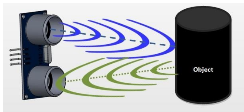
Figure 6: Ultrasonic sensor

Like bats, the ultrasonic sensor uses SONAR to determine particle separation. Here, ultrasonic sensors are used to detect objects and move them as required. Sunshine and dull content have little impact on the action, whereas sensitive constituents such as texture can be difficult to detect acoustically. Via an ultrasonic transmitter and a beneficiary device, it comes from a variety of sources [11].