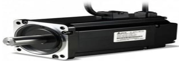
Figure 5: Servo Motors

Here three servo motors are used in triggering, one servo for panning movement, the second servo for tilting, third servo for recoiling. A servo motor is a linear actuator or rotary actuator that allows for precise control of linear or angular position, velocity, and acceleration [10].