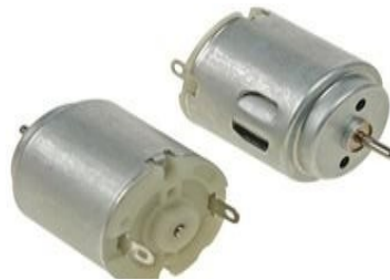
Figure 3: DC Motors

DC motors are used here for high RPM (Revolution Per Minute). This will help the darts to cover a larger distance with more rpm. The DC motor is the device which converts the direct current into mechanical energy. Lorentz Law is the basic principle of DC motors, which states that the current-carrying conductor placed in a magnetic and electric field experiences a force [8].