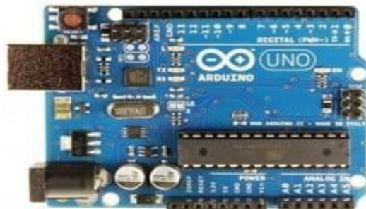
Figure 4: Arduino Uno

Arduino UNO is a microcontroller of 8 bit based on ATmega328P which acts as the brain of the system which controls all the devices. It has 14 digital I/O (input-output) pins, 6 analog inputs, a quartz crystal of 16MHz, a power jack, a USB connection, an ICSP header, and a reset button [9].