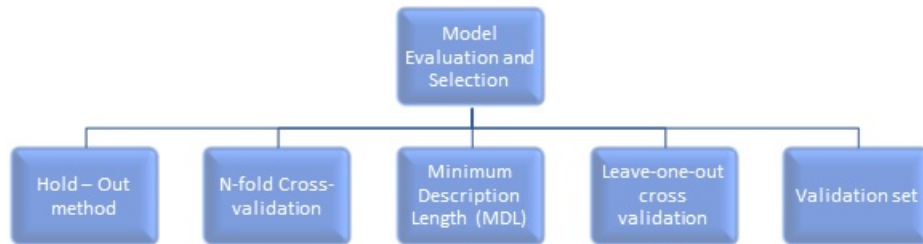
Figure 2: Model Evaluation and Selection