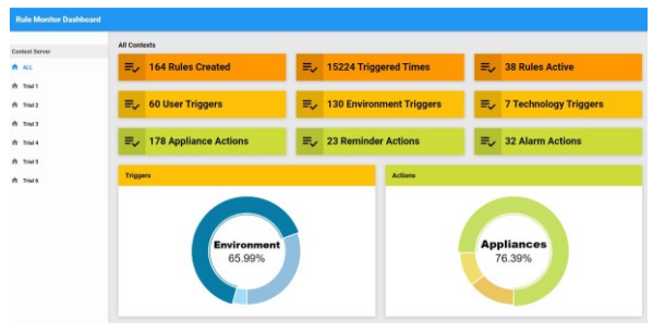
Figure 2 : The TAREME display of some automation analytics (from [14])

on what automation would have been triggered in that context, with the possibility to receive and explanation in natural language on why or why not they would have been executed. The platform also includes functionalities for remote monitoring and analytics of the automations [14]. Figure 2 shows some of the information that it is able to display.