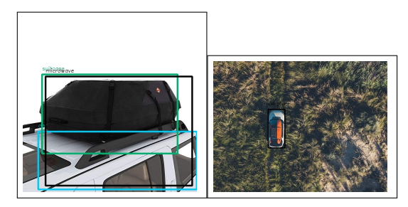
Figure 5: Images with bounding boxes actually bad, flagged good (In the 1st image "suitcase" is also detected as "microwave"; in the 2nd image, "car" is detected as "cell phone").