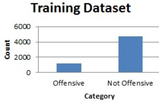
Figure 1: Distribution of data in the data set

were compared. The use of BERT for the problem of hate speech identification for Arabic language had also been carried out.