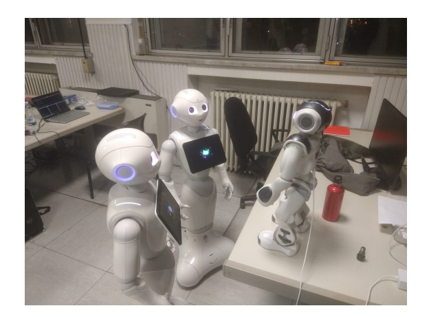
Figure 1: NAO placed on the table to direct its speakers towards the two Peppers' microphones

sentence always considers its action as a success, the other agents may judge outcomes differently. For instance, the distance between the speakers of a robot and the microphones of another robot, or the fact that NAO's and Pepper's microphones are placed over the robots' heads, may lead the speech recognition systems to fail.