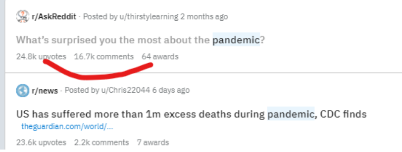
Figure 2: The most commented Reddit pandemic post

Here, conducting textual semantic analysis of the commented post statements the following semantic groups are allocated: