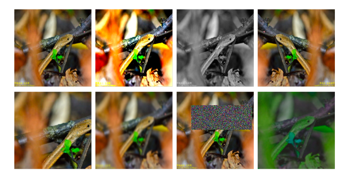
Figure 2: Augmentations for self-supervised learning. From left to right, top to bottom: original image without augmentation, color jittering, gray scale, horizontal flip, random resized crop, Gaussian blur, random erasing, a composed random augmentation of the above.

The macro F_1 is calculated by averaging the F_1 scores over all the species [1],