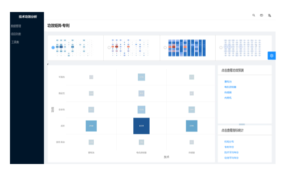
Figure 4: System Interface.

inputting the description of the project; 2) patent retrieval. inputting keywords to select the patent documents in a specific field; 3) technology selection. selecting the technical means that apply in specific fields; 4) function selection. selecting the function that corresponds to these technical means; 5) TFM generation. visualizing the TFM in the form of a bubble chart. The overall workflow is shown in Figure 3.