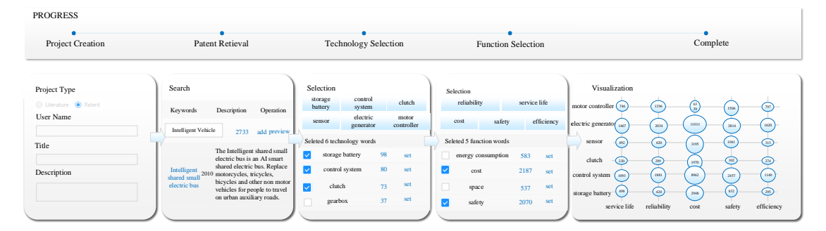
Figure 3: Workflow of TFM construction system.