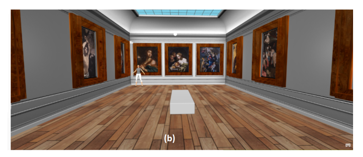
Figure 1: The 3D environment: a) the reception with Sam, b) the Ricciardi room with Marta.