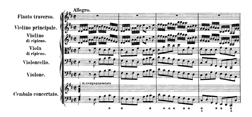
Figure 1: Incipit of the Brandenburg Concerto No.5 in D major, Johann Sebastian Bach.

to record, edit and play music. While MIDI is more focused on connectivity and music playback than to actually representing symbolic content, more recently MusicXML[6] has been proposed as an XML-based format for encoding western musical notation. It is intended for the exchange of music documents across different scorewriters and other applications. The Music Encoding Initiative (MEI)<sup>6</sup> is a community-driven, open-source effort to define a system for encoding musical documents in a machine-readable structure. Like MusicXML, MEI is encoded as an XML language, but includes a more advanced representation of notations beyond the common western one (e.g. mensural and medieval neume notations).