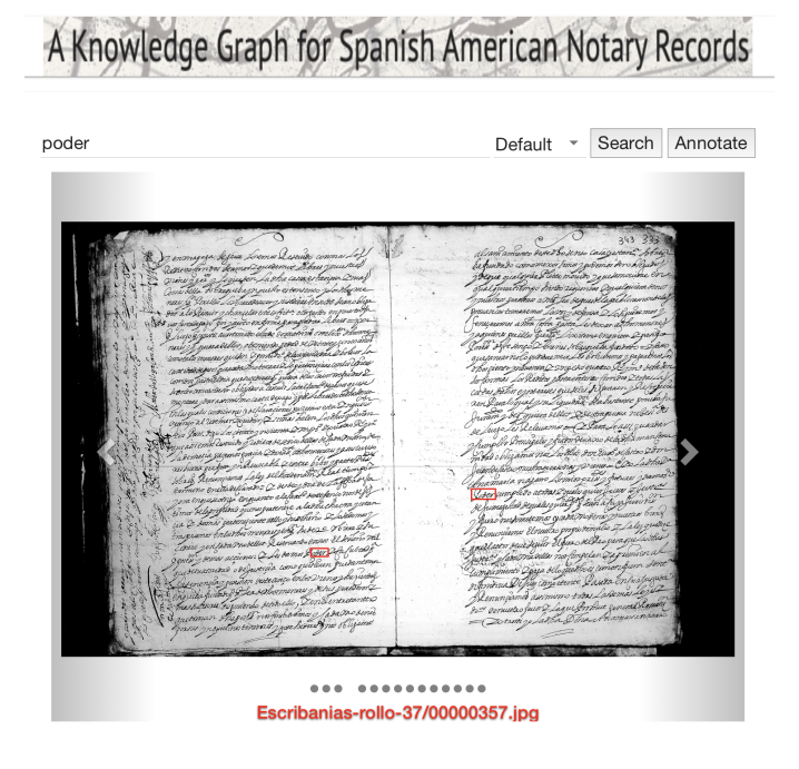
Figure 2: Search UI: results for keyword 'poder'

During the demo, a user can interact with KGSAR by posing queries and correcting the bounding boxes as well as labeling new words. We highlight the primary features of KGSAR.