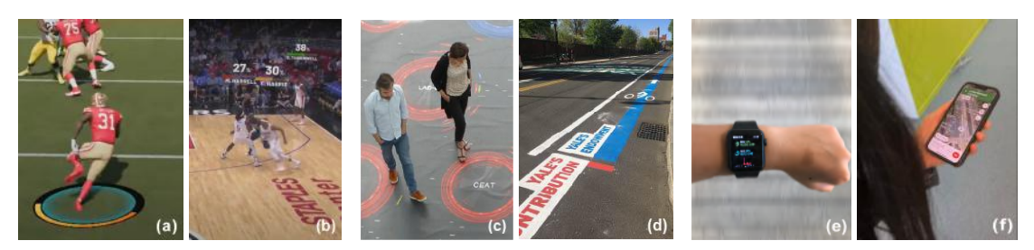
Moving visualization & stationary viewer. Stationary visualization & moving viewer. Moving visualization & moving viewer.