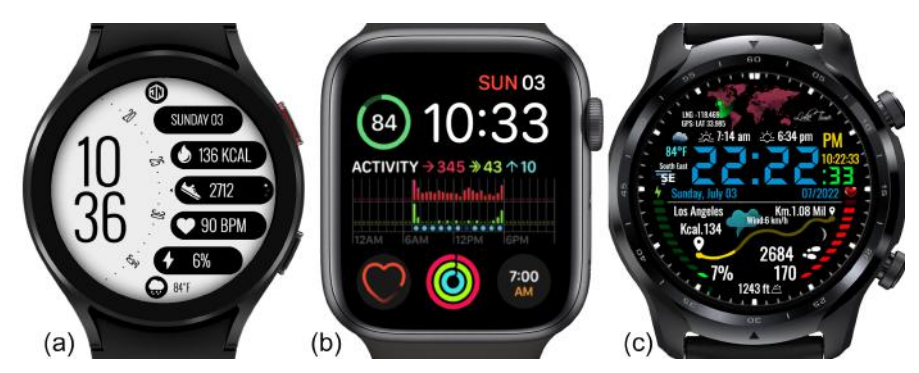
Figure 2: Example of sports smartwatch faces. Watch face design by: a) JN-Rolling (JN-WatchFaces), b) New Design (Enid Rodriguez), and c) Voyager GPS-01RB Sport 24H (Luke Time) from Facer App [45].