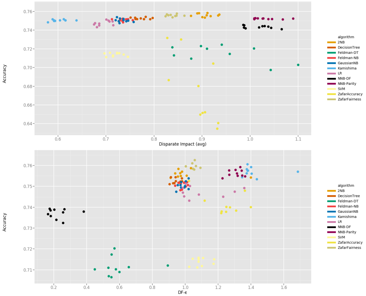
Figure 1: Scatter plots of accuracy vs. disparate impact for Income-Race and vs. \epsilon -score for Income-Race-Sex

DF- \epsilon (as defined in 4), DF-bias amplification score (as defined in 5). We also compare the resultant distribution of labels over groups of S on a single random train-test split.