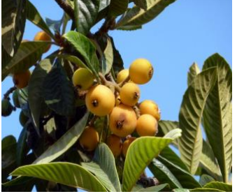
Figure 2 : Eriobotrya japonica (Thunb.) Lindl.