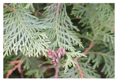
Figure 6: Thuja occidentalis L.