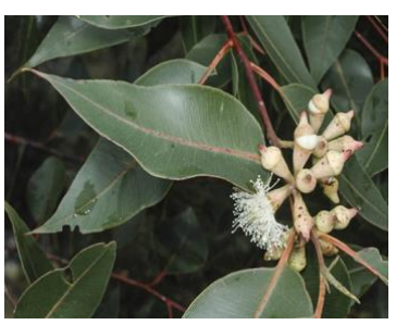
Figure 3: Eucalyptus robusta Sm.