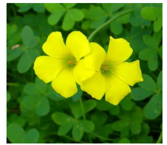
Figure 1: Oxalis pescaprae L.

Another very interesting and crucial issue is that of invasive plants-when alien species spread into landscapes through trade, traffic and horticulture (the most common dispersal pathways) [31,32]. Invasive plants can affect bioregions causing serious ecological/environmental damage and measures should be taken targeting the human-facilitated introductions. Studies have shown that the composition of the invasive plants is higher in parks containing highway greenings and public gardens. The alien species of the present study cover large areas because of their extensive quality. According to Kowarik [1], although the presence of alien plant harbours risks, these risks are mostly related to particular species and do not apply to the whole group of alien ones. This very fact explains the need for programs targeting species management and their implementation by many municipalities advising against planting alien species.