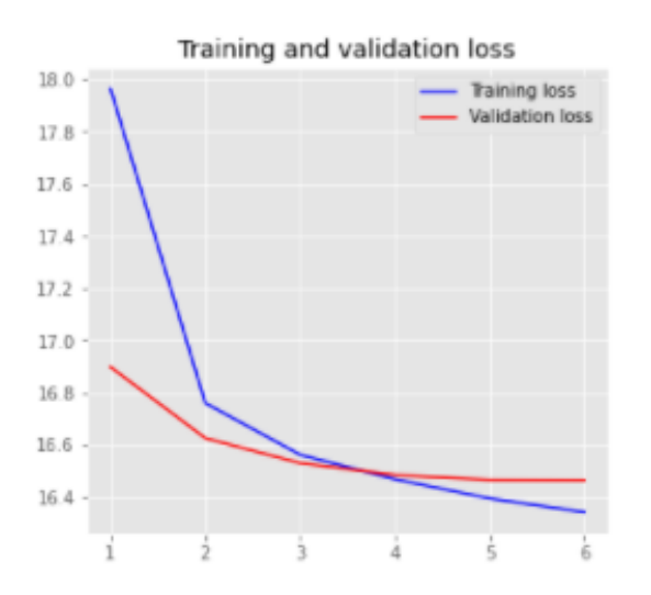
Figure 2: Learning curves of the BiLSTM-CRF Malay POS model

Using the prepared dataset, we evaluated our BiLSTM-CRF model. In evaluating our model, a similar evaluation of Jason [12] that used training loss and validation loss were used to ensure our BiLSTM-CRF model was not underfit or overfit. Based on Figure 2 below, the small gap in learning curves between training loss and validation loss indicates the model was neither underfitted nor overfitted.