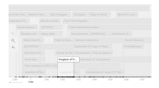
Figure 4: Output timeline overview