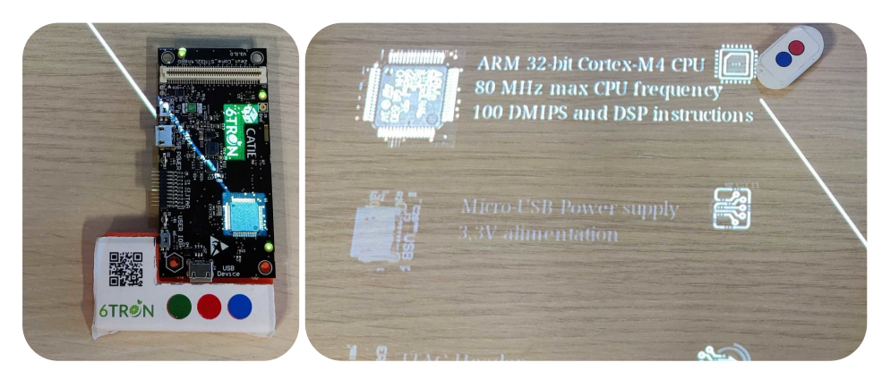
Figure 1: Left: Electronic card identification, using colored dots, and QRCode to get more information using a phone. Right: item selection using tokens.

on the electronic card to identify it as seen in figure 1. 3D mapping on the card enables to create animations on the card at the correct size. When the card is identified by the camera, we display several related information around it. The tangible interaction is a physical token on which we placed colored stickers. In a next iteration we plan to use a colored token with a logo instead of the two dots. One can manipulate the token and place it in the AR space. There are two ways one can interact with the display :