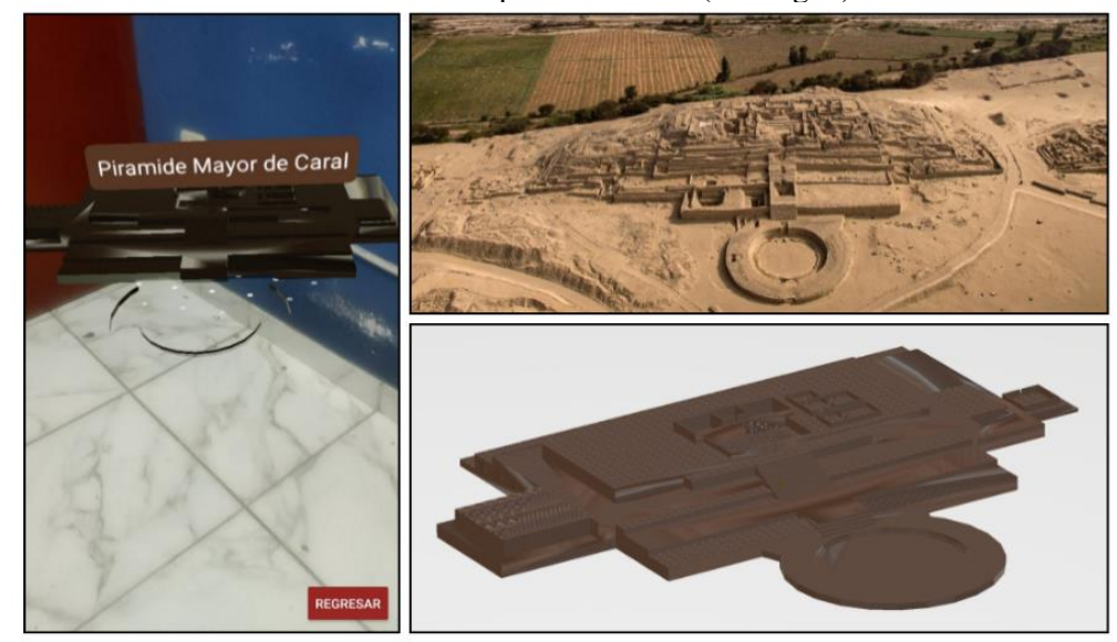
Figure. 3 Augmented reality of the Great pyramid of Caral in the mobile application with a reference image and the 3D model used.

For the functionality of the augmented reality screen, we work with the type of augmented reality without markers, so it is necessary to detect a flat surface with the camera of the mobile to show the 3D object and the information video. For the application we work with a 3D model of the major pyramid of Caral because it is one of the most attractive points of Caral (See Fig. 3).