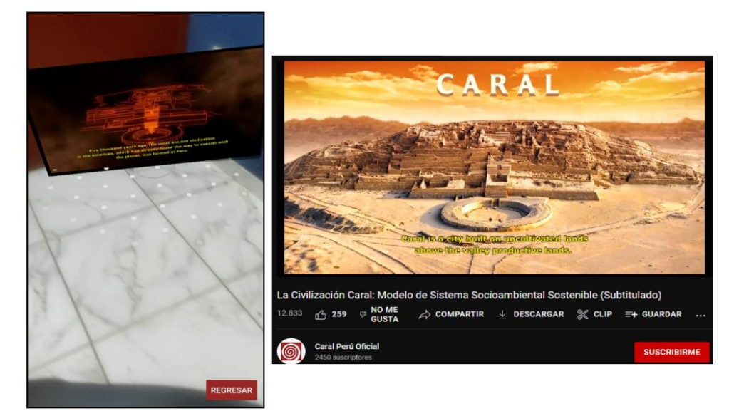
Figure. 4 Augmented reality making use of audiovisual content from Caral's socio-environmental system model.

Finally, based on the research of this new application with augmented reality to be implemented in Caral would taken 4 months. This time will focus on the 3D modeling of the 6 main pyramids of Caral and the development of the application. For the costs of the application, a minimum budget of $500 is foreseen be-tween the resources, the modelling process and the development process.