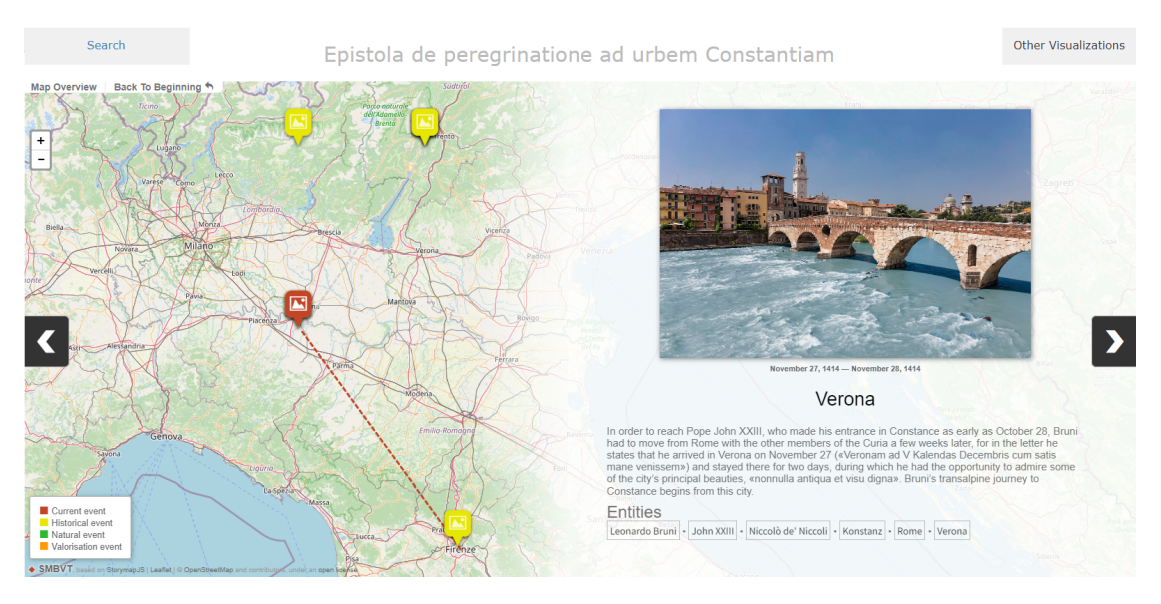
Figure 3: The event about Leonardo Bruni's departure from Verona as visualised on the story map.

previously published application so that the public link always points to the latest story-map version. This operation is necessary to support the continuous updating and enrichment of the story while offering the users always the latest version. Therefore it guarantees a long-term story's maintenance, usability, and accessibility. At the moment, one user at a time can review and modify a story map.