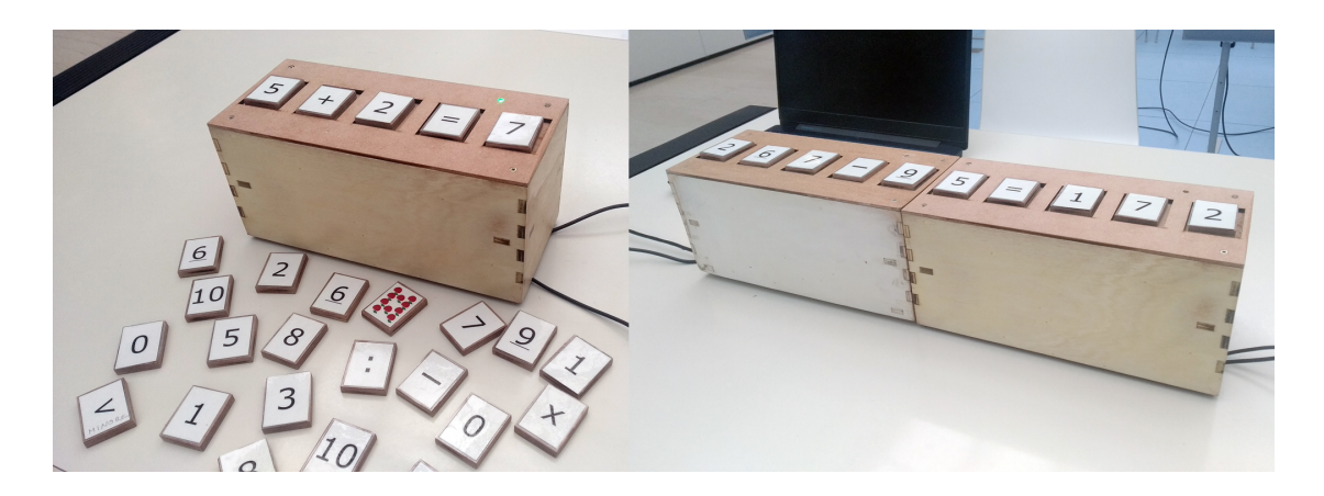
Figure 2: The figure presents two pictures, one representing one SMARTER 2.0 and math tiles (left side) and the other a possible scenario with two SMARTER modules joined horizontally (right side).

of the board (5 values, one for each reader): the latter represents the state of the board. The formalization of the MQTT commands is reported in Table 1 - Appendix A.