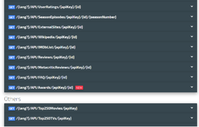
Figure 1: IMDb API page (endpoints).

As soon as the data has been collected, SentiStrength (SentiStrength - Sentiment Strength Detection in Short Texts - Sentiment Analysis, Opinion Mining, n.d.) will be used for sentiment analysis on the comments. Using this tool, a given sentence is split into words and analyzed for sentiment. By comparing each word to a set of words associated with a particular sentiment, this analysis is performed. After asking the user for a title, the program gets the movie's ID from the API, which is then used to retrieve the reviews. The sentiment value of each comment is then calculated using SentiStrength, which ranges between -5 and 5.