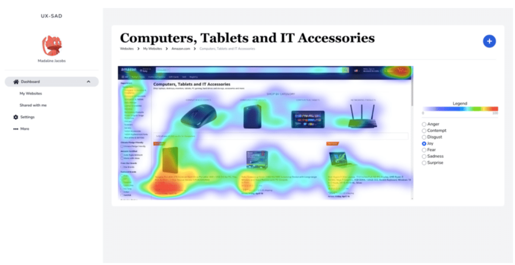
Figure 2: SERENE dashboard (example from Esposito et al., 2022)

To display sentiment analysis in fields other than text, SERENE uses which is an online tool for user experience sentiment analysis. During the data collection process, this tool gathers data itself if it is implemented on the platform. Whenever an action is taken by a user on a page, it is recorded to be analyzed later [15]. With the SERENE dashboard, a heatmap can be created based on the data gathered through user interaction.