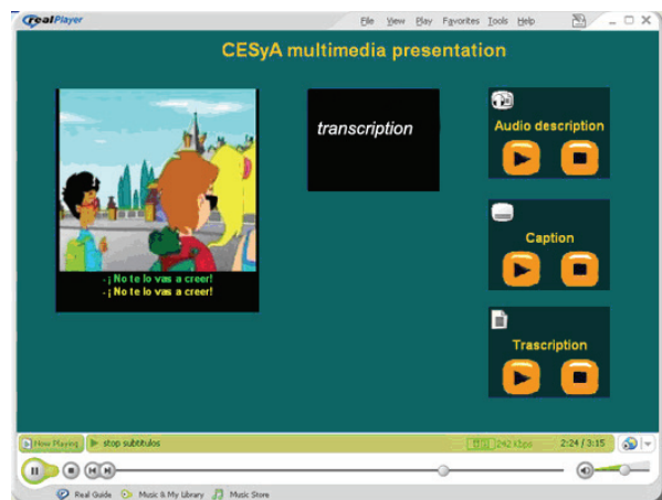
Figure 1. Accessible Interface Prototype for Audiovisual Works Reproduction

In this line, a study case is presented. Two different accessible interfaces have been built. Both of them are able to play any multimedia content. The interface in Figure 1 allows the user to activate and/or deactivate the different audio and textual alternatives within the multimedia information.