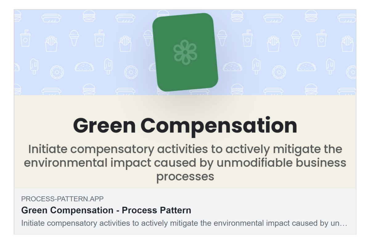
Figure 2: Preview of a resource as displayed on social media platforms.

tional perspective. While the innovations and characteristics presented in this paper will remain integral to the site, other functionalities might be subject to change or improvement. An initial set of 33 patterns from academic resources (e.g., [8, 11, 12]) has been added to the site. As of today, the site features one exemplary pairing, three cheat sheets, and five case studies. The website is developed for compatibility with varying screen sizes, offers an RSS feed for subscription to updates, and includes sharing cards for promoting content on social media platforms (see Figure 2). The site's content administration is facilitated through a content management system. Contact information for suggesting content is provided on the site.