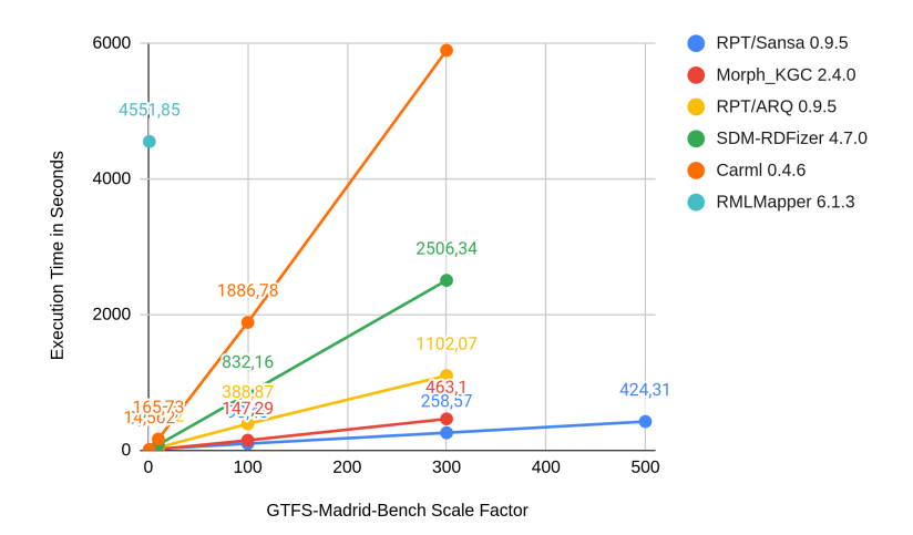
Figure 8: Comparison of RML mapping tool performance with 128G RAM. On scale factor 500, RPT/ARQ and Morph_KGC ran out of memory. Carml and SDM-RDFizer were already a magnitude slower on scale factor 300 and were not further evaluated. RMLmapper already exhibited a very high execution time on scale factor 1.

a first step we evaluated several RML tools on a server with 128GB RAM, AMD Ryzen 9 5950X 16-Core CPU and SSD storage running Ubuntu 20.04. In order to establish comparability, we used all tools' native unique output feature<sup>26</sup>. The results for the scale factors 1, 10, 100, 300 are shown in Figure 8. We also attempted to evaluate RocketRML, however we ran into memory issues with it<sup>27</sup>. As for RMLStreamer [22], on the one hand it requires a Flink setup and on the other hand the initially obtained execution suggested that it lacks the self-join elimination - similar to RMLMapper.