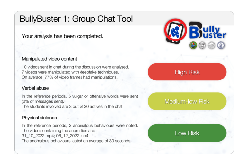
Figure 5: Final dashboard of the BullyBuster framework that allows to analyze the behaviour of a group of individuals to assess the risk of actions attributable to the problem of (cyber) bullying.

data and determines the presence of deepfakes, violent comments, and stress levels. The outcome is a report that the instructor can consult; it provides the percentage risk of cyberbullying actions for the specific modules and the overall risk for the class.