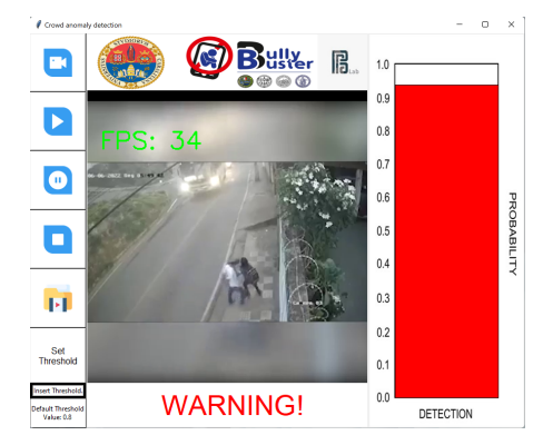
Figure 4: Demonstrator of the crowd analyzer built into the BullyBuster framework. The system detects suspicious behaviour and reports it to a human operator.

images, videos, etc.) to cause harm to another person, referred to as a victim. The following definition is very close to cyberbullying, which is "an intentional aggressive act by an individual or group of individuals, using electronic forms of contact, repeated over time against a victim who cannot easily defend himself or herself" [6]. Unlike standard forms of bullying, Cyberbullying is very dangerous because it can be perpetrated anywhere, anytime, and victims cannot often stop or reduce the spread of these activities [7].