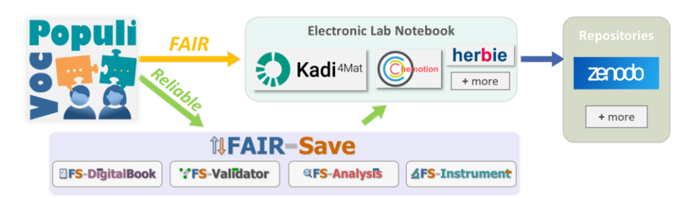
Figure 1. A visual overview of our FAIR data production pipeline. VocPopuli is the application for creation of FAIR vocabularies – these vocabularies can then be used by either our suite of FAIR-Save applications, or in conjunction with ELNs, for FAIR data publication in open repositories.

The following components of our framework present one route in which FAIR data can be produced, stored, and published (Figure 1). The motivation for the creation of this framework comes from the needs of lab scientists whose workflows need to be digitalized. The flexible and open protocols easily allow for the incorporation of other applications that subscribe to the FAIR data initiative. The different components serve different purposes, namely: (1) VocPopuli is the metadata schema manager which provides templates to (2) ELNs; (3) data in the ELN is then paired with the VocPopuli vocabularies, and exported on Zenodo; (4) the communication between scientists and the ELN is enabled through a set of applications that accompany scientists in their various activities, either manual (e.g., specimen cleaning) or digital (e.g., data analysis). A demonstration of part of the framework is available at: <a href="https://youtu.be/lS8w-LwwGU4">https://youtu.be/lS8w-LwwGU4</a>.