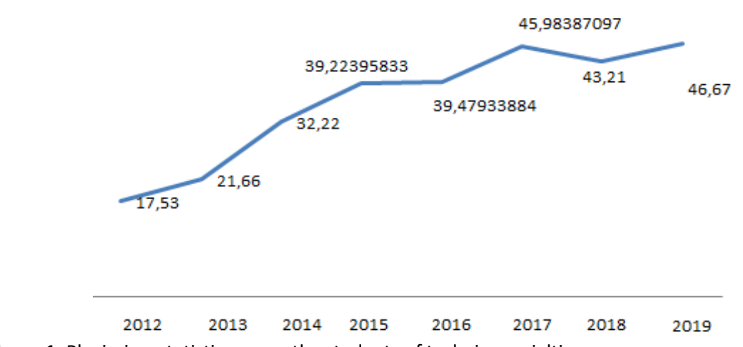
Figure 1: Plagiarism statistic among the students of technic specialties

Nowadays the most critical problem of our society is finding new content for a significant number of sites, articles from different areas, and new significant research in scientific materials. Unfortunately, the statistic of plagiarism in Ukraine as in other countries in the world is very sad. For instance, a national survey published in Education Week found that 54% of students in the USA admitted to plagiarizing from the Internet and 74% admitted that at least once during the past school year they had engaged in "serious" cheating [12-13]. In 2016 according to the polish investigations Ukraine engaged the fifth position in academic plagiarism among the students [14]. Plagiarism statistics among the students in National Aviation University on technic specialties is no exception (Figure 1).