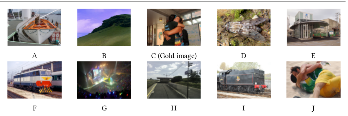
Figure 1: Candidate images for the phrase t "tender embrace".

Q : What is the most appropriate caption for the tender embrace? Answer Choices: (A) a small boat sitting on top of a dock. (B) a group of people walking on a green hill. (C) a student gets a hug from a student. (D) a large fly laying on a rock in the water. (E) the bus stop at the station (F) a train is parked at a station. (G) a crowd of people watching a concert. (H) a train station with a sign on the side of it. (I) a black and red train on a track. (J) a man laying in the sand on top of a surfboard.