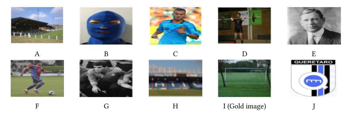
Figure 3: Candidate images for the phrase t "football goal".

We are going to present some qualitative results regarding few-shot prompting. Fig. 3 contains candidates corresponding to the phrase "football goal", while GiT-L (greedy) serves as the captioner. The k=5 in-context samples are demonstrated in Tab. 7 followed by the answer A generated by GPT-3.5-turbo (in color) corresponding to the given Q . In the presented case, in-context prompting achieves in guiding GPT-3.5-turbo to select the correct candidate I.