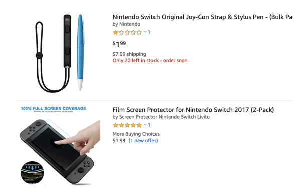
Figure 3: Price re-ordering on Amazon.com , showing degrading relevance in the result set when querying for "nintendo switch", and then re-ranking based on price.