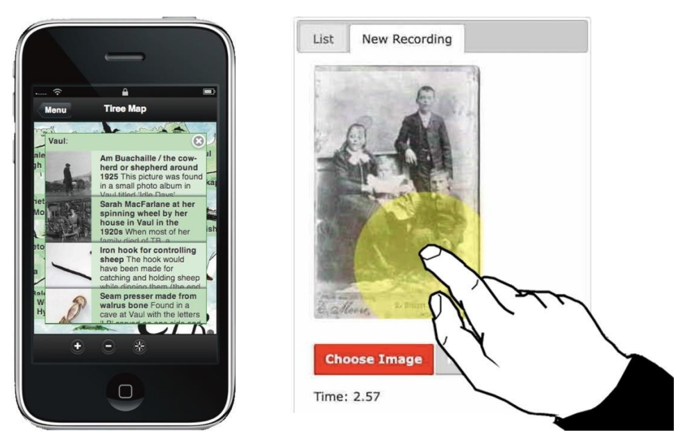
Figure 1 : Left: Frasan – mobile access to a small island archive. Right: TalkOver – audio annotations of pictures

The map navigation is more complicated, perhaps there ought to be a completely different mode of menu navigation with a 'near by' option and structural navigation for exploring geographically based on the township areas of the island. This already begins to feel like a different application; does that matter?