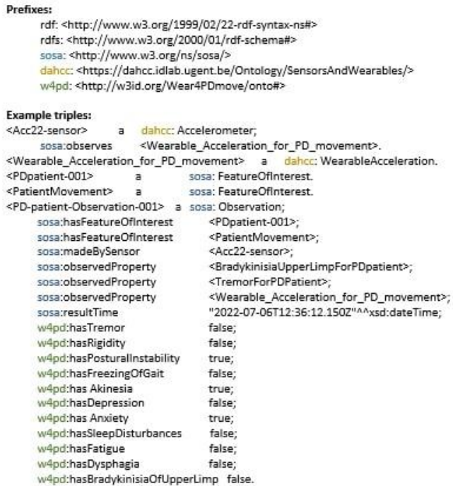
Figure 3: Example triples of Wear4PDmove ontology

The Wear4PDmove ontology integrates stream data from wearables and static/historic data from PHR databases to create a PHKG. Its purpose is to enable health apps to reason about high-level events, such as 'missing dose' or 'patient fall'. The ontology has specific requirements that need to be met. Our approach encompasses a comprehensive representation of patient data, including movement patterns, daily activities, and personal health records. By integrating data from diverse sources like wearables and personal health records, we create a unified, real-time view of an individual's health. This integration enables continuous monitoring and timely alerts for healthcare professionals. To analyze and interpret this integrated data, we employ a scientific methodology and structure it uses a PHKG. This logical framework supports informed decision- making.