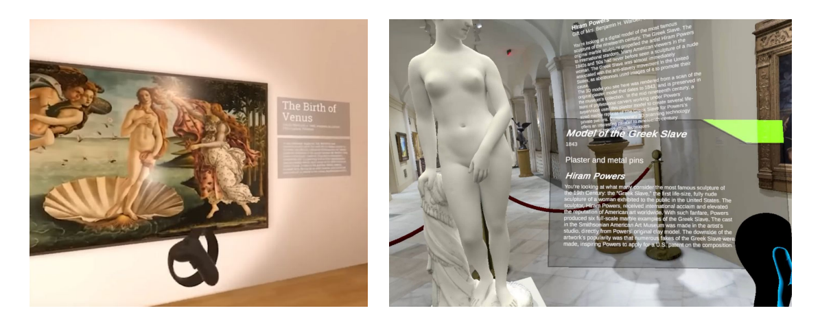
Figure 1: A still shot from two Metaverse museums. (left) VR Museum of Fine Arts. (right) Smithsonian American Art Museum "Beyond The Walls".

world; a reduction in carbon emissions caused by people physically traveling to the museum, especially for long-distance travels; a safer way to visit exhibitions in case of healthcare crises (e.g., the recent COVID-19 pandemic); a more accessible way to visit exhibitions for people with physical impairment or other restrictions that prevent them from safely visiting museums in person. Additionally, a museum in the Metaverse allows for more flexibility and interactivity in the contents presented to the visitors. For example, it could contain recreations of historical places and artifacts that no longer exist (e.g., project Rekrei<sup>1</sup>), and provide access to places too delicate for physical interaction. Consider the Lascaux Cave in France, closed due to the paintings' deterioration from light, air changes, and carbon monoxide from visitors' breath<sup>2</sup>.