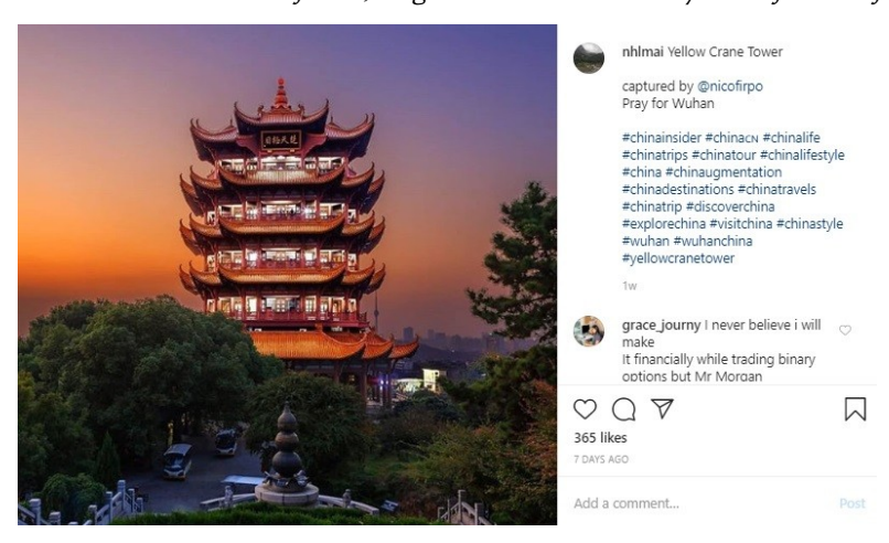
Figure 2: Description provided by ShareCaptioner for this image: The image captures a breathtaking view of the Yellow Crane Tower, a renowned landmark in Wuhan, China. The tower, a multi-tiered structure, stands majestically against the backdrop of a vibrant sunset. Its red roof and gold accents gleam under the setting sun, reflecting the rich cultural heritage of the region. The tower is nestled amidst lush greenery, with trees encircling it, adding a touch of serenity to the scene. The perspective from which the photo is taken allows the tower to dominate the frame, its grandeur accentuated by the soft hues of the sunset.

with a categorical-cross-entropy validation loss of 0.3830. Thus, early stopping was used as a mechanism to prevent overfitting on the train set.