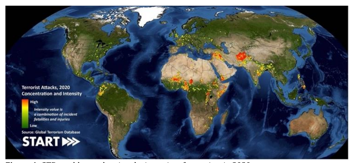
Figure 1 : GTD world map showing the intensity of terrorism in 2020

Figure 1 [2] is a graphic representation of the globe map that covers many forms of terrorist activity. According to the information shown by this map, the distribution sites of terrorist activity are situated in the region immediately around Kazakhstan.