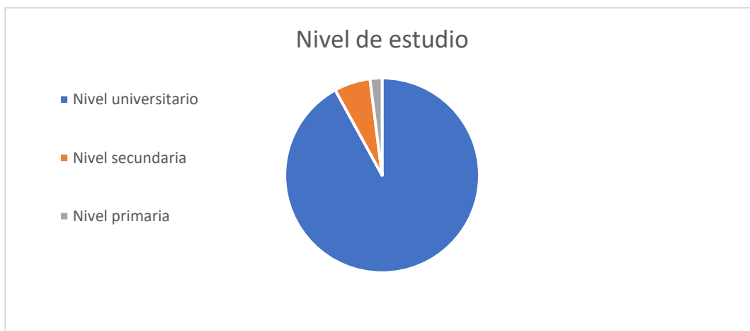
Figure 2: Educational level at which the flipped classroom was applied