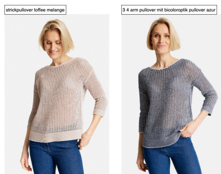
Figure 2: Hard non-matching (negative) pair from Zalando dataset

prove model performance, we curated non-matching (negative) pairs. To accomplish this, we leveraged text and image embeddings generated by pre-trained RoBERTa and Swin-Transformer models, incorporating them into multimodal embeddings. Subsequently, we employed an approximate nearest neighbor search within the resulting embedding space to identify, for each Tommy Hilfiger and Gerry Weber product, the most similar non-matching Zalando product. As a result, our negative samples included products that exhibited visual similarities in their images or shared textual characteristics but ultimately did not constitute a match. Exemplary matching and non-matching pairs represented in terms of their pre-processed product titles and images are shown in Figures 1 and 2.