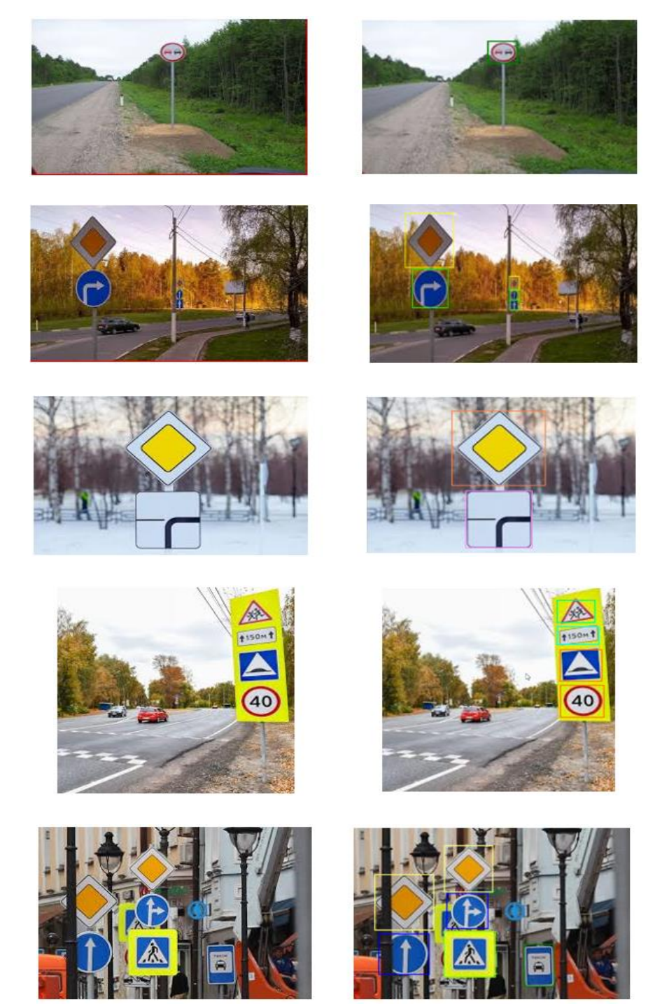
Figure 3: Examples of original images (left) and processed images (right)

In the second stage, the neural network itself was trained directly based on the prepared annotations and dataset. In the "logs" folder, files in ".h5" format were created, which are the results of Mask R-CNN training. Then, for subsequent image processing based on the trained model for traffic sign recognition, the last trained model, which is the most accurate of all the previous ones, was loaded.