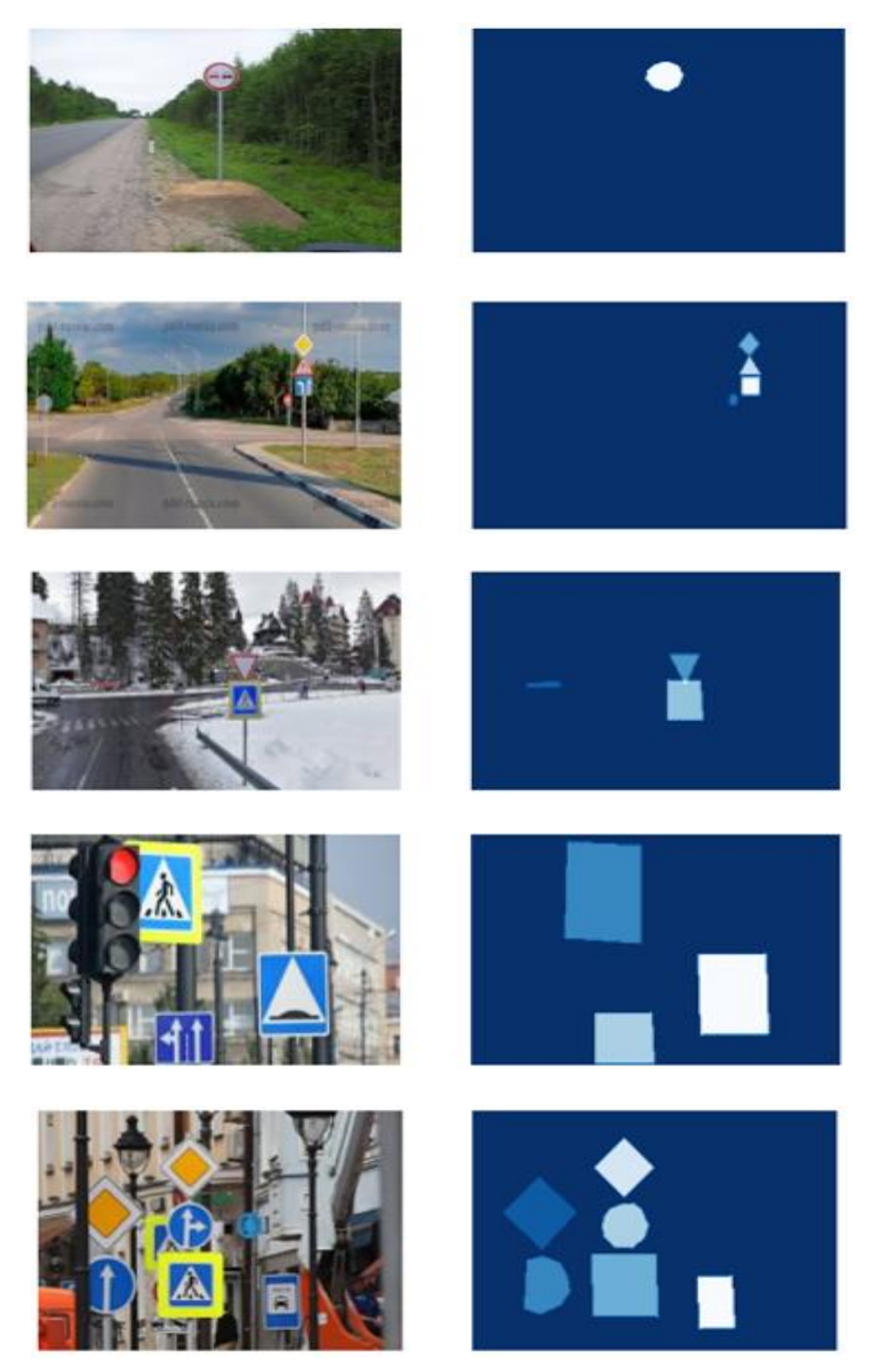
Figure 2: Image of traffic signs with a neural network mask.

Then, the following actions were performed in two stages. In the first stage, the number of images was checked and preparatory processing was performed for Mask R-CNN training.