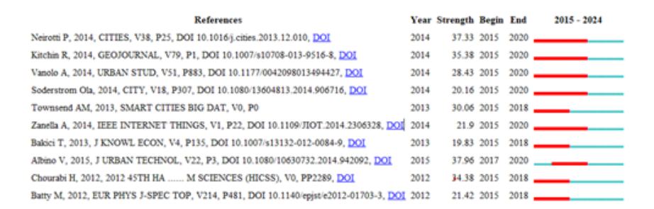
Figure 1: Top 10 references with the strongest Citation Burst