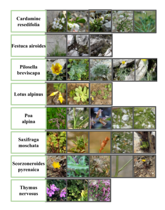
(a) Vegetative plot (test)