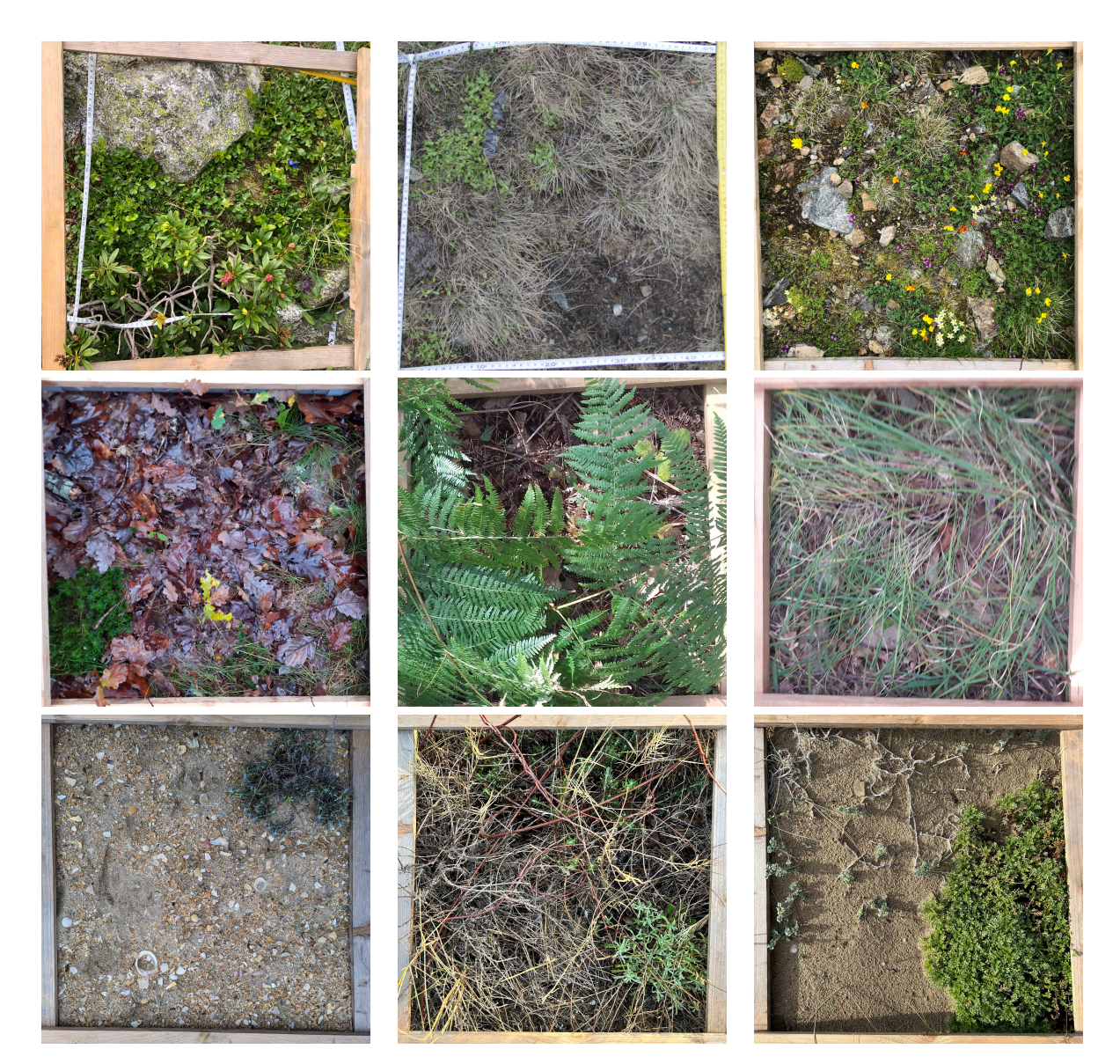
Figure 2: Illustration of the diversity of plot images in the test set.

classifier head being fine-tuned, was trained for approximately 17 hours over 92 epochs with a batch size of 1280 per GPU and a high learning rate of 0.01 (hyperparameters for data augmentation techniques and other features are detailed in the Zenodo package [4]). The second model, ViTD2PC24All, was initialized with the weights of the previously trained ViTD2PC24OC model and was then fully fine-tuned (all layers) for approximately 36 hours over 92 epochs with a significantly lower batch size per GPU (144) and learning rate (0.00008). Both models were trained with a cross-entropy loss since the objective of the training is to predict a single species per image.