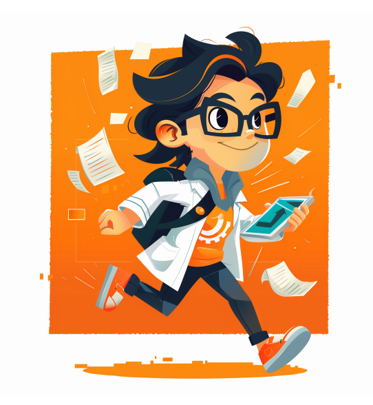
Figure 1: Picture from semantic.observer depicting a scene from an enterprising researcher's life.

venues, and thus assist with developing a strategy for publishing their work, also informs academics of new potential venues for publication in their line of work and notifies them of relevant recently published, upcoming and updated deadlines for submission.