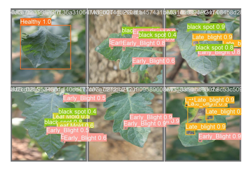
Figure 3: Visualization results of the proposed method on the tomato leaf disease dataset