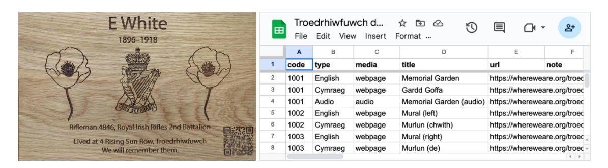
Figure 3: Final installation in Troedrhiwfuwch Memorial Garden: (left) Laser-cut plaque; (right) Configuration spreadsheet in Google Docs;

As noted, we wanted to be able to easily reconfigure the Memorial Garden both to future proof the installation and also to create a research infrastructure for more innovative projects. The final embodiment has been installed with a planned life of at least 10 years.