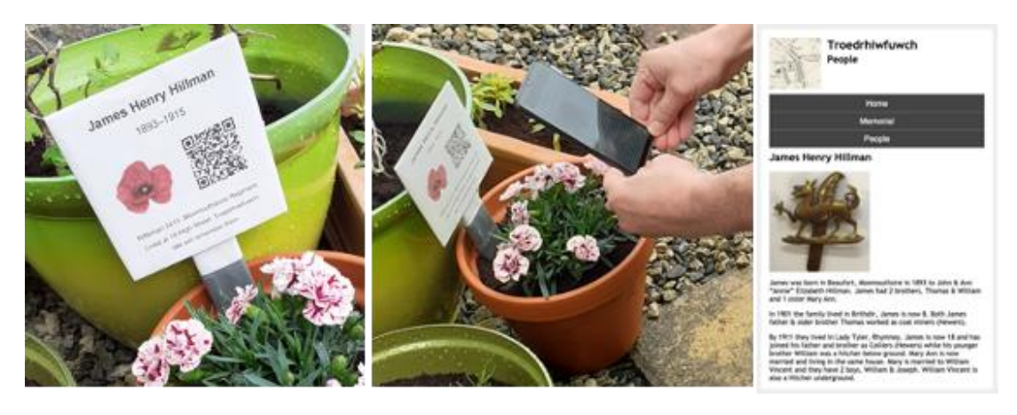
Figure 2: Early working prototype for open day

Based on the outcomes of these stages three aspects moved to a second level of development. TalkOver is an application designed to help people talk about digital photographs recording both what they say and also what they point at in the photo [4]. Also, a group of PhD students have 3D scanned many of the items transferred from Troedrhiwfuwch church to Pontlottyn church and created a VR gallery. The third, was the QR-code based signage, which is the focus of this paper.