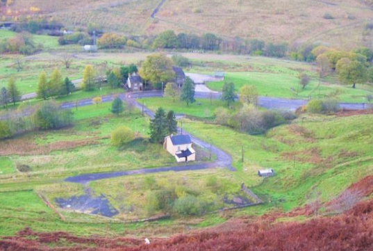
Figure 1: Trowdrhiwfuwch before and after evacuation and demolition