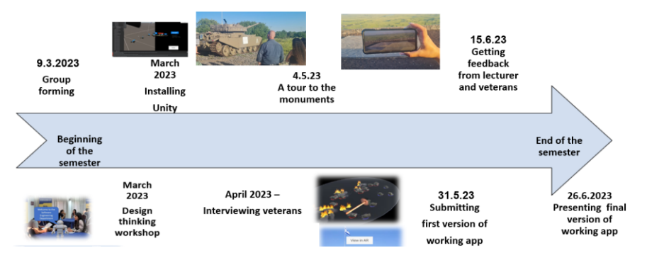
Figure 1: Course schedule and main milestones

Leveraging on [7], that showed that AR technologies are mature enough to be standardized for cultural heritage sites usage, a course for Software Engineering (SE) students in their fourth and last year of studies, was designed. Each team of students got the task to develop an AR application, showing visitors the details of the battle that took place, while displaying AR objects in 3D, using the personal mobile phone. The main goal of each application was to allow visitors to go back in time to some of the historical and symbolic battles of October 1973. As part of the project, the plan was to embed barcodes in several heritage sites, which can be scanned and viewed on a mobile phone let in the areas described in the battle.